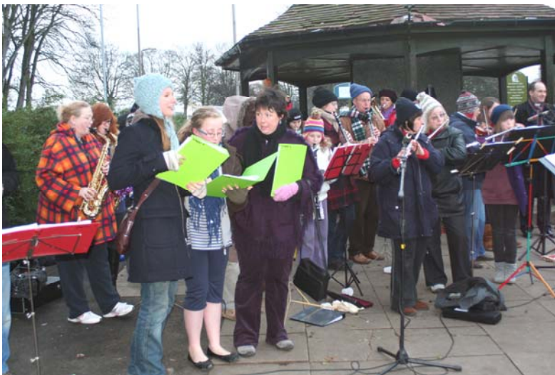
Members of North Leeds Music Centre playing Christmas Carols at Oakwood Clock, December 2009