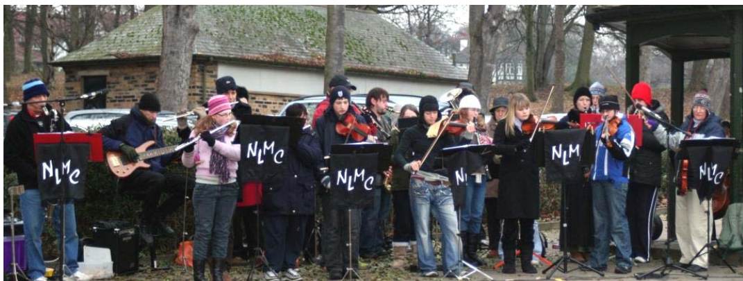
Members of North Leeds Music Centre playing Christmas Carols at Oakwood Clock, December 2007